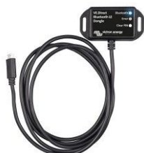
VE.Direct Bluetooth Smart dongle (must be ordered separately)

An excessively high or low battery voltage is indicated by an audible and visual alarm, and a relay for remote signalling.