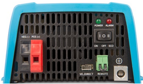
Phoenix 12/375 VE.Direct