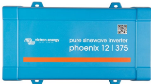
Phoenix 12/375 VE.Direct